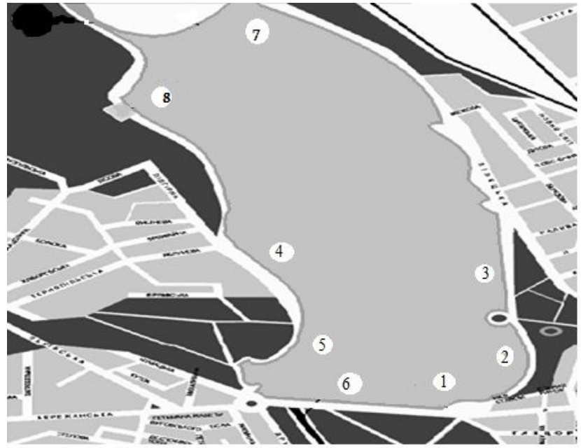
Fig. 1. The scheme of monitoring sites of the reservoir "TernopilPond" (1: 15000).