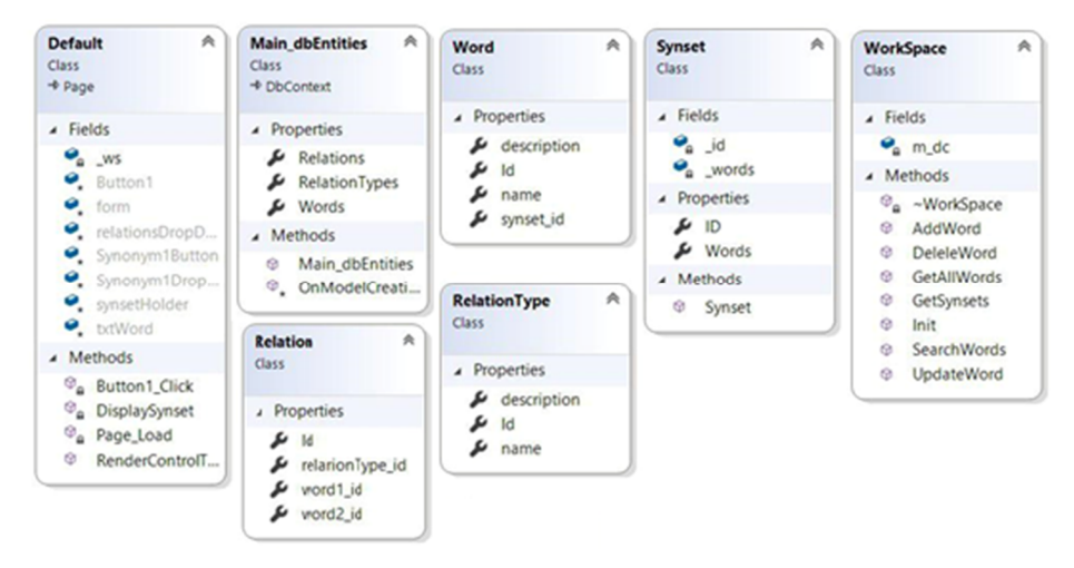
Fig. 7. System classes and interfaces

Figure 7 presents the classes and interfaces of the developed system.