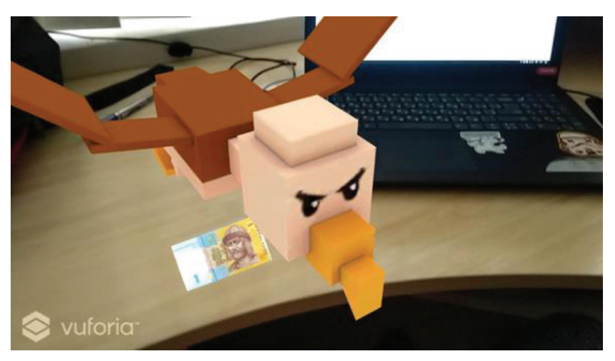
Figure 2. What we see on a smartphone.

In the third stage, students compile the project for mobile platforms. In the first stage, students needed to download the .apk file to their smartphones and install the application.