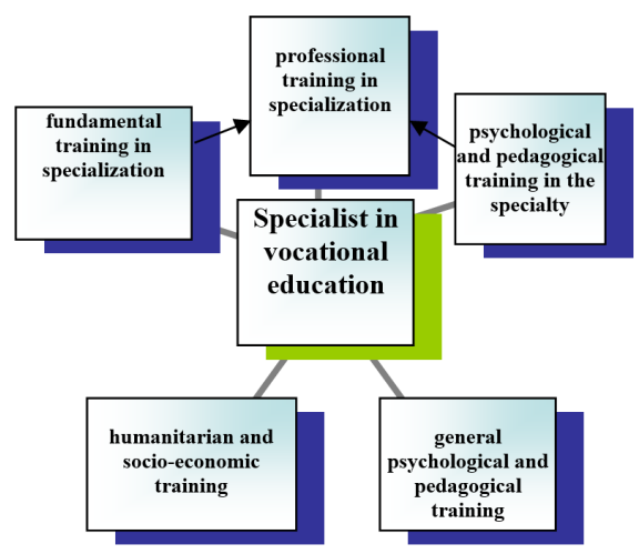
Figure 1: Structural scheme of training future specialists in vocational education.

Taking into account the basic principles of higher education development in Ukraine within the Bologna process, as well as the specifics of professional training, we offer a scheme of educational process based on fundamental and psychological-pedagogical training with a dynamic model of professional disciplines (figure 1).