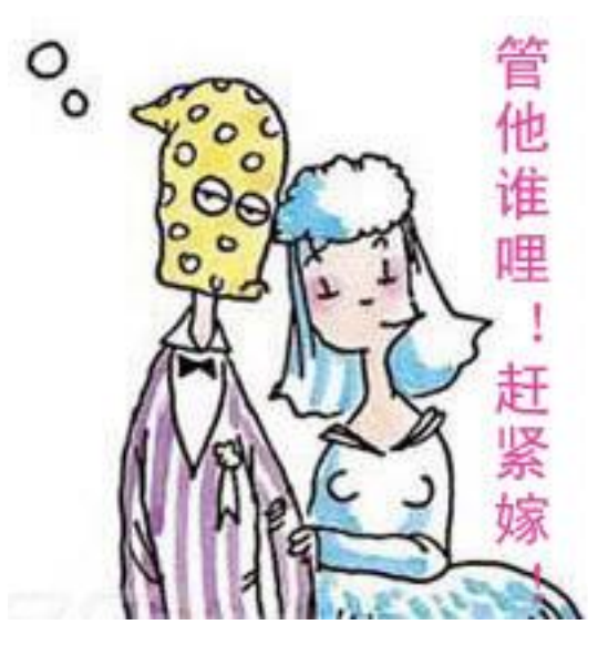
Picture 6. A representation of jihūnzú 急婚族— 'a group of people who rushes to get married'<sup>7</sup>.

A couple is laying in a tent that is made of a marriage certificate ( jiéhūnzhèng 结婚证) on Picture 5. The word 'marriage certificate' is written on the tent. We can assume that the tent represents a house of the couple referring to 'a naked marriage'. A picture with a house and a car can be noticed inside of a circle above in the sky. The man and the woman appear to be looking at this picture in the circle. The tent has also a word xixi 喜喜 'a double happiness' written on it. The characters are often written on various wedding decorations or wedding presents in China.