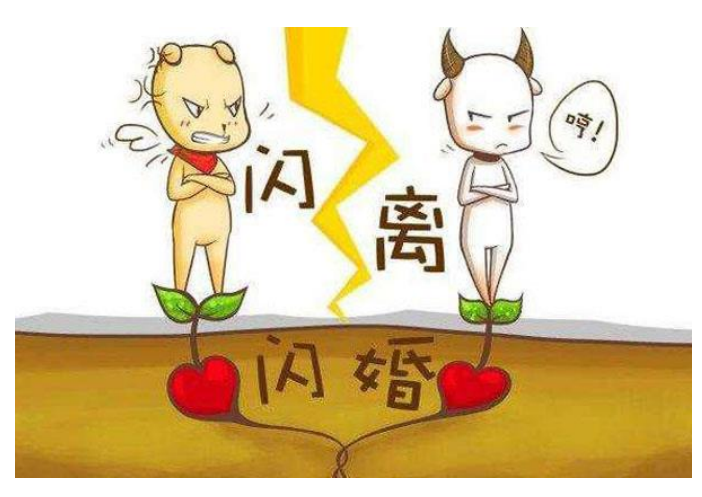
Picture 3. A representation of 'a flash marriage' and 'a flash divorce'<sup>4</sup>.

On Picture 2 we can see a man and a woman standing on a heart with a word luŏhūn : 裸婚 'a naked marriage' written on it. The woman seems to be running away from the man who wants to keep her. The woman is holding a card where a word líhūn 离婚 'divorce' is written. We can also notice a following sentence in a thought bubble: Zài yě wúfă rěnshòu méiyǒu fángzi de rìzi 再也无法 忍受没有房子的日子 'Can't stand the days without a house anymore'. A cloud in the sky holds a house. We can notice a word gāofángjià 高房价 'high housing costs' written inside the cloud.