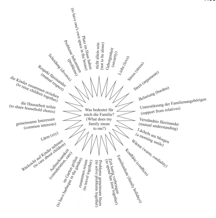
Fig.1. Example of "The Associations Star"

"The Associations Star" can be used in the following way. This is an example of the technique used for studying the topic "Familie" ("Family") in the process of learning the German language: