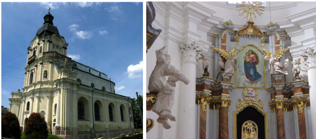
Figure 3. Church of the Most Holy Trinity in Mykulyntsi (performed by Oksana Diachok)

Today the Trinity Church is an architectural monument of state value (security number 681) [9]. Located on the elevated plateau, the temple is well perceived from all four sides (Figure 3). The building is a three-nave basilica with a semicircular two-level deambulatory. The naves are covered with the cross-shaped vaults; the middle one has a semicircular completion. The curvilinear facade has a dynamic plastic and the silhouette that distinguishes this church among the other Baroque sacred buildings of Eastern Galicia. The three-dimensional composition of the building is step-pyramidal, formed by the combination of simple shapes and volumes of different sizes. The church has a rich architectural decoration which is concentrated on the main facade and is completed with a small tent-shaped dome harmonizing with a main facade curved line. The facade decoration includes different stone sculptures, decorative vases, developed cornices, pilasters and alcoves.