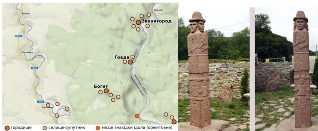
Figure 1. Map of the location of the main settlements of the Zbruchcult center (performed by Borys Yavir Iskra). Contemporary copy of the idol, set near Sataniv village

researchers' concepts, there was an idol, probably of the god Sviatovyt, which was found in 1848 in the waters of the Zbruch near Husyatyn. The Zbruch idol Sviatovyt is a IX century sculpture, one of the rare monuments of the Slavic pagan cult, a three-meter quadrangular pillar. Each side of the deity is divided into three parts – heaven, earth, and the beyond, (Figure. 1). The original of this statue is currently kept in the Archaeological Museum of Krakow (Poland) [4]. Such archaeologists as I. Rusanova, B. Tymoshchuk, M. Yahodynska in their researches defined the Zbruch cult center as one of the largest pagan religious and cultural centers of the Slavs [5]. Ancient Zbruch settlements had a peculiar structure. They performed not so much a defensive function, but the sacred one. Shafts were surrounded by sacrificial fires, that was not typical for that time. There were grounds with idols, ritual moats, pits, wells and bread ovens.