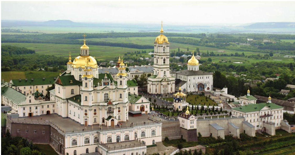
Figure 4. Pochayiv Lavra in XXI century

Sacred buildings in the classicism style may be found only on the territory, which in the early XIX century was under the rule of the Russian Empire. In the style of early classicism, the Bishops' House was built (security № 672/4) in the Pochaiv Lavra in 1825. The building is rectangular and has a different facades height. The monastery gate carcass (security № 672/6), is built in 1835 by the architect Mykhailivsky. The main facade of the monument is constructed in the shape of the four-columned portico of the Doric Order (Figure 4).